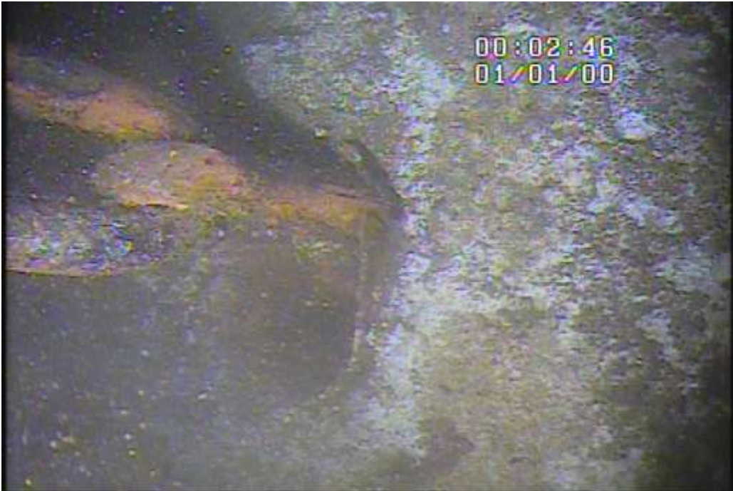
Typical deteriorated chain at breakwater hole (bottom of concrete breakwater)