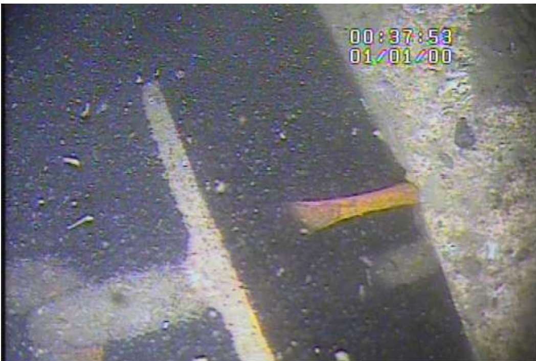
Typical deteriorated chain at concrete kellek anchor (also shows kellek locking plate)