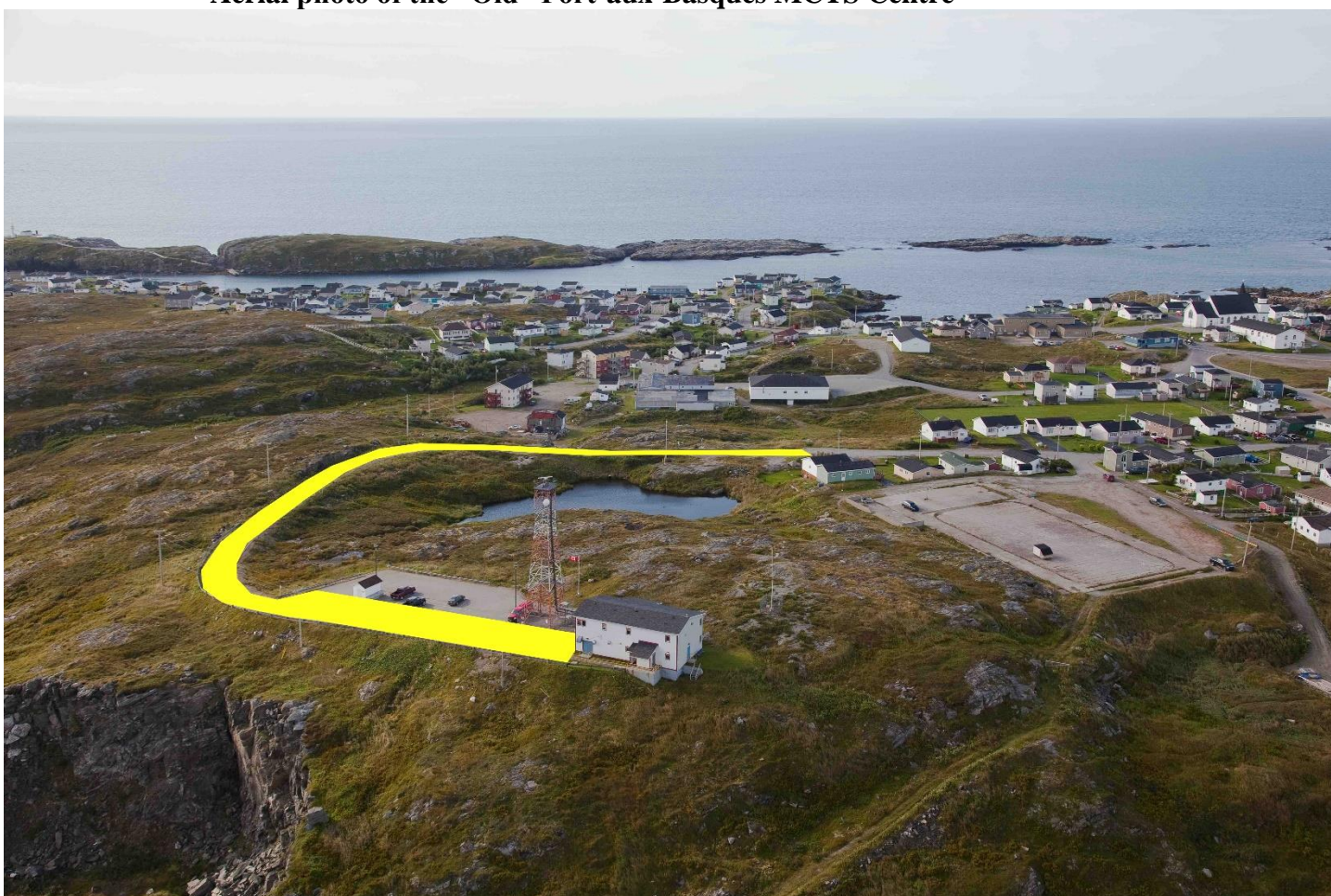
*The Yellow represents the area of Snow Clearing & Ice Control required for this facility

Aerial photo of the "Old" Port-aux-Basques MCTS Centre