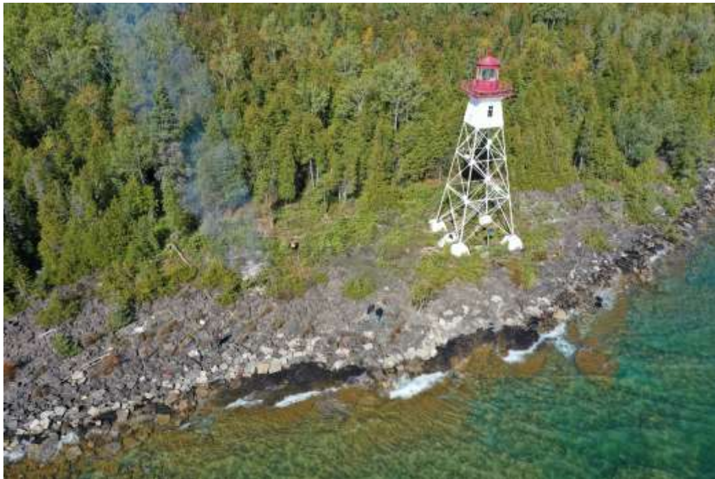
Figure 3: Project Site – Site brushed in 2019 (Photo taken during brushing)