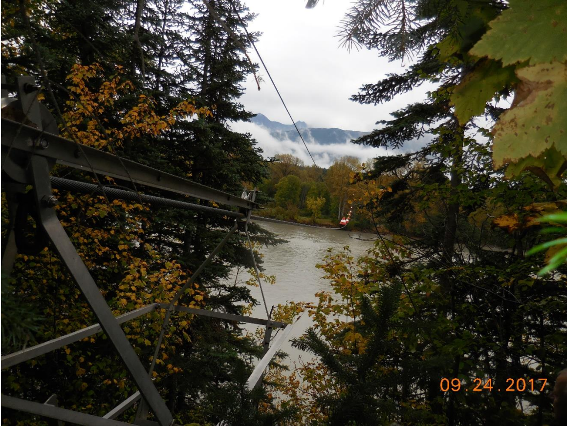
Figure 6: Nass River above Shumal Creek, Main Cable and Marker Cone Cable