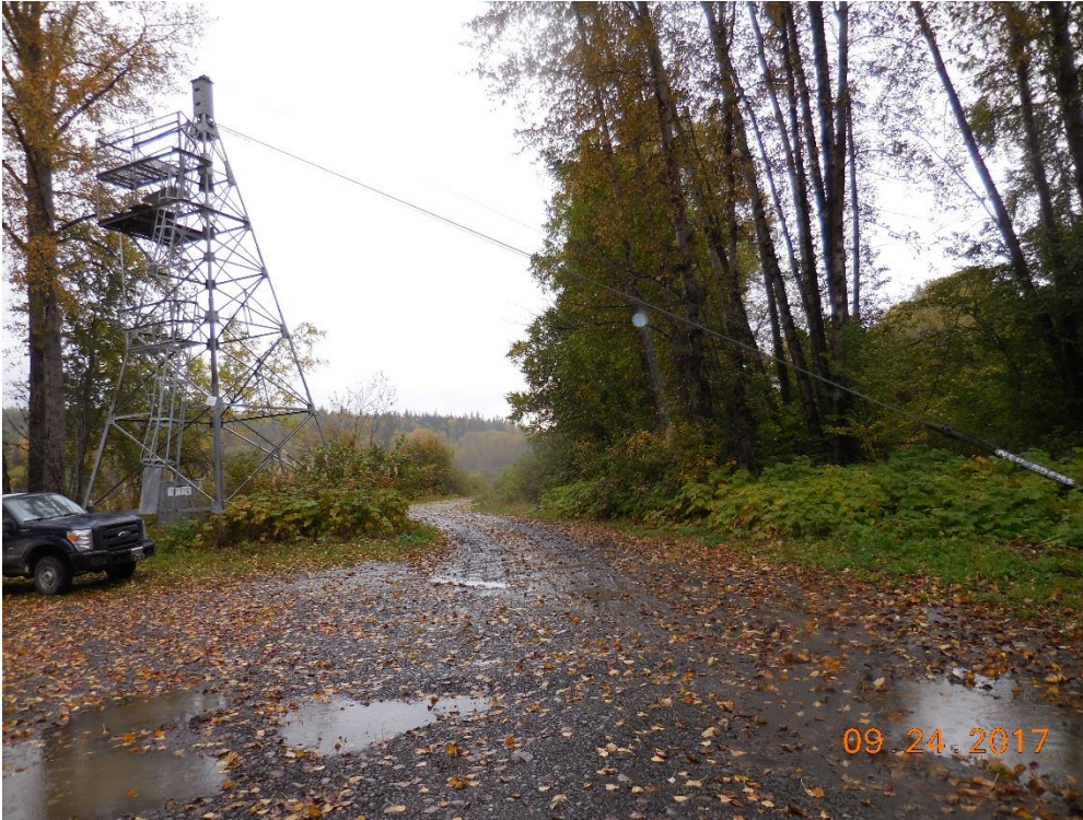
Figure 3: Nass River above Shumal Creek, Left Bank Tower