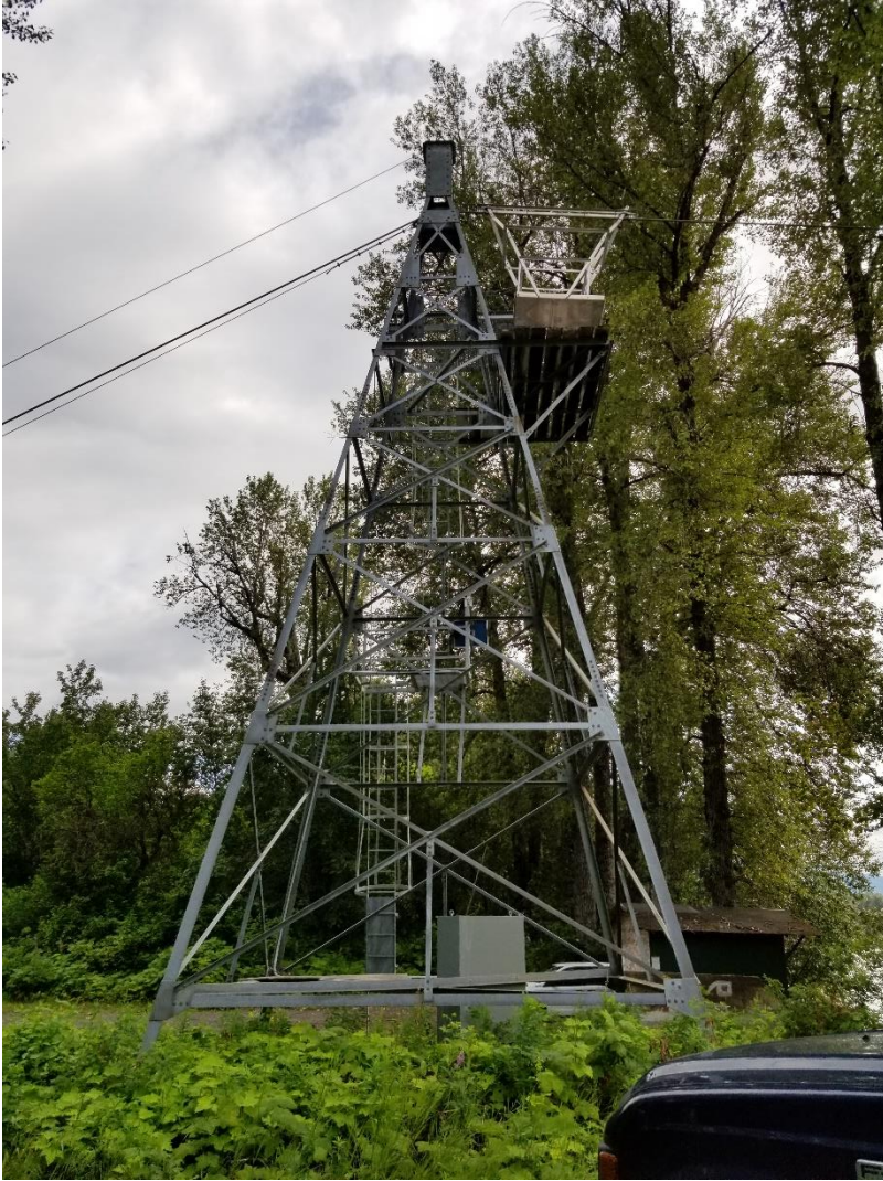
Figure 5: Nass River above Shumal Creek, Left Bank cable car