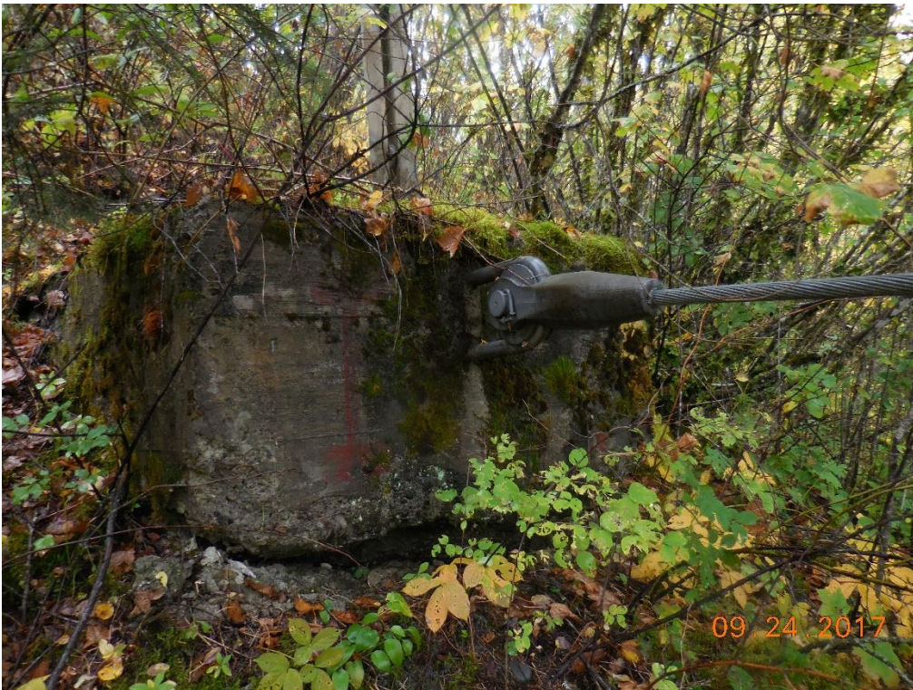
Figure 4: Nass River above Shumal Creek, Right Bank Concrete Mass Anchor