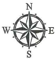
Map of Alberta First Nations Communities 1:2,478,445